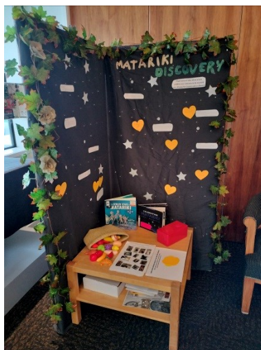
Matariki Discovery in Children's corner