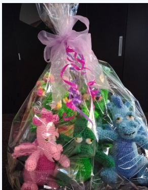
Mum and Dad dragon and three children

Tickets available for purchase at the Morrinsville Museum and September October Market Days