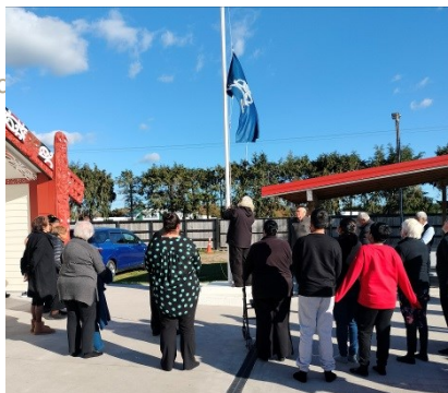
Lowering of the flag after a very successful Marae Experience