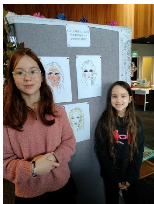
More Makeup Discovery