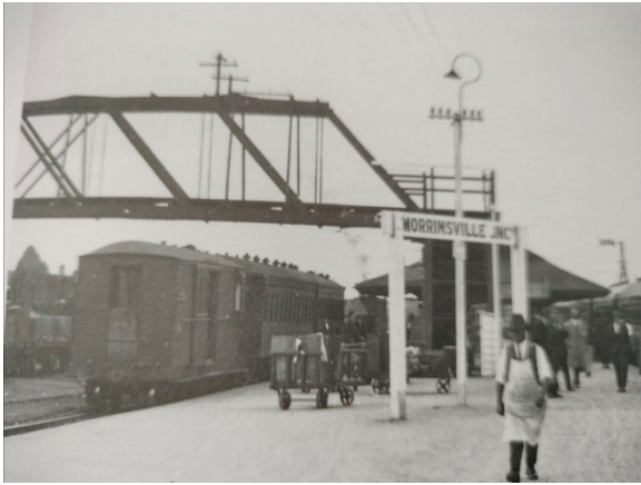
An early photograph showing the pedestrian walk-over to the Morrinsville Railway Station.