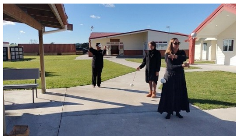
Learning to twirl the poi at the Marae Experience