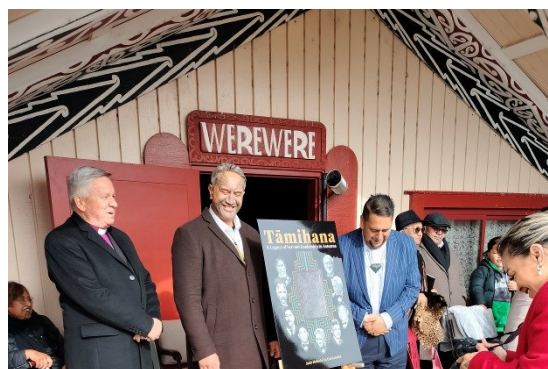
The launch of the book Tamihana . A Legacy of Servant Leadership Aotearoa

Answer to cabinet of curiosities: Computer Floppy disc storage..