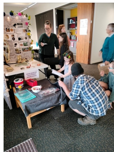
The Makeup Discovery in the Children's corner was very popular